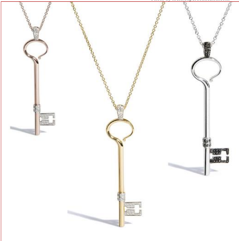
The Lockkeepers Collection

Inspirational, classy – and limited -- luxury key jewelry from The Lockkeepers Collection is making a fashion mark around town.